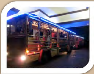
Holiday Dinner & Trolley Ride