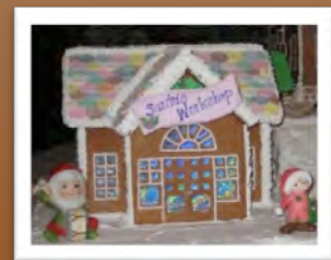
Christmas Brunch & Santa's Gingerbread Workshop