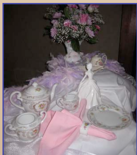
Winter Tea at HCC

Space is limited, so call now to reserve your Tea-Time! January 23rd * 1 st seating - 2:00 pm * 2 nd seating - 3:00 pm Cost is $30 per person; call 441-9420